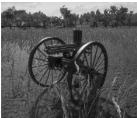
(One of the many Gatling Guns on ACW – Redemption)

New Maps! The 8thLR has decided to add two new maps to the 8thLR Civil War event! The maps ACW – Redemption and Bloody Lanes have been added! Bloody Lanes is a historically accurate map made using maps from the United States Archives made by Slyk_MinionWorkz.